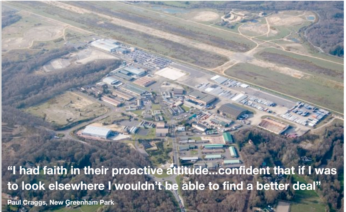
Image: New Greenham Park site as seen from the air

“I had faith in their proactive attitude...confident that if I was to look elsewhere I wouldn't be able to find a better deal”