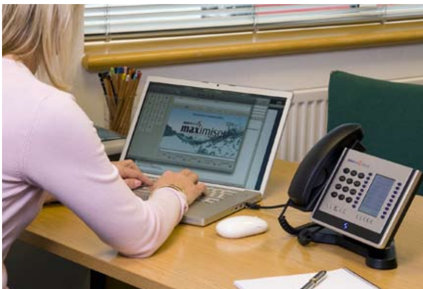
The stylish design of the PCS 560 & 570 looks good in any setting and from any angle